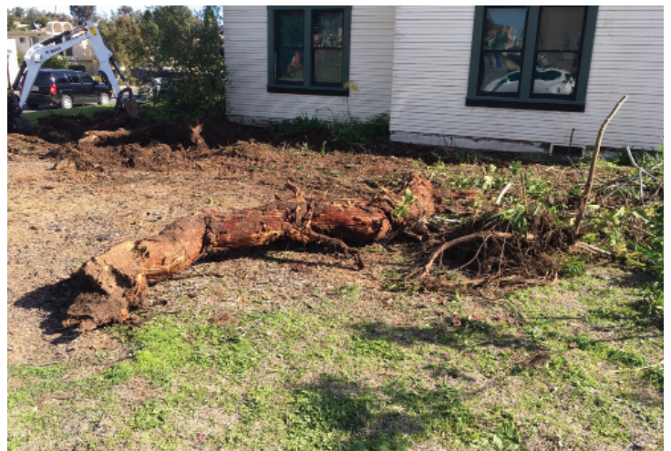
The enormous pine tree root pulled during demo.